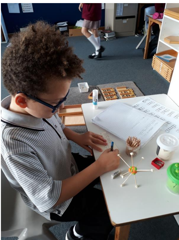
Researching and building atoms